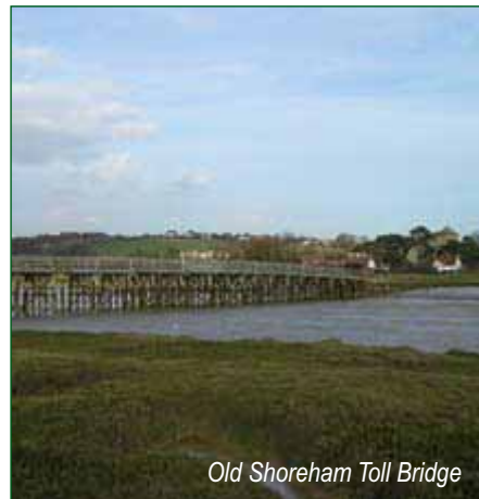
Old Shoreham Toll Bridge

Cross the bridge to meet the A283 which you cross. Left along Old Shoreham Road by The Red Lion and Amsterdam pubs to crossroads (GR215060).