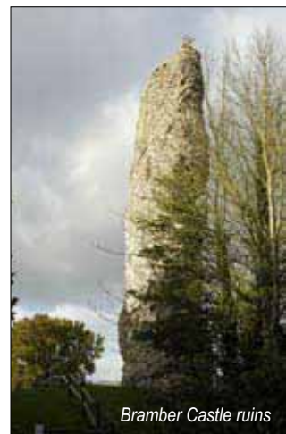
Bramber Castle ruins

3b. Left into Erringham Road and right up Mill Hill. Both junctions are signed 'Youth Hostel and Mill Hill'. You are now starting a long climb. Cross the A27 by a bridge and pass Mill Hill Nature Reserve and Area of Outstanding Natural Beauty. The views from here are fantastic. Continue to the car park and junction of road and bridleways (GR207097).