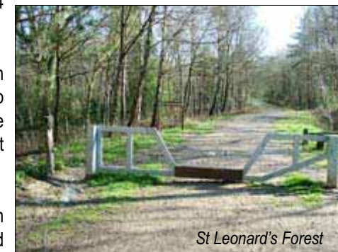
St Leonard's Forest