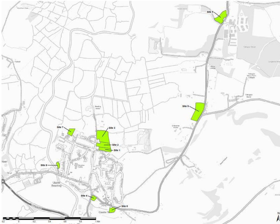
Figure 1: Map of all sites considered in the site assessment