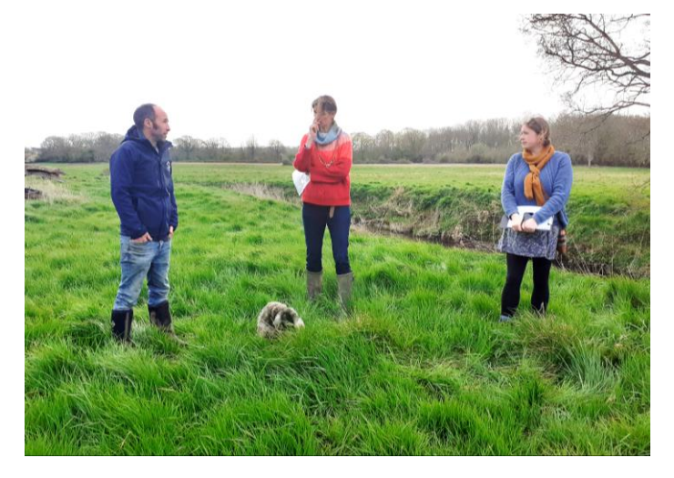
Wilder Horsham District on a joint site visit in Shermanbury with the Ouse and Adur Rivers trust (OART).

Achieving practical, on-the-ground change for nature's recovery is only possible with the support of the landowners and community groups we work with, and our wonderful volunteers. We would like to extend a big thank you to all who have been involved in Wilder Horsham District so far as we roll into our fourth year – it is your support that is making this project such a success, and we are very excited to see what we will achieve together in the coming year.