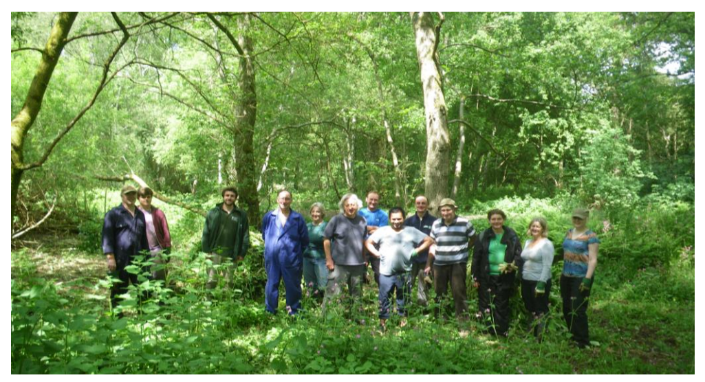
Horsham District Council volunteers out on site.