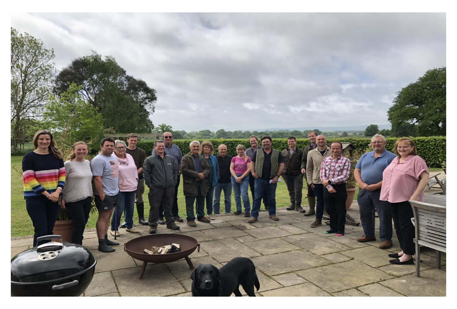
A handful of the landowners and conservation staff involved in the pioneering Adur River Recovery project.