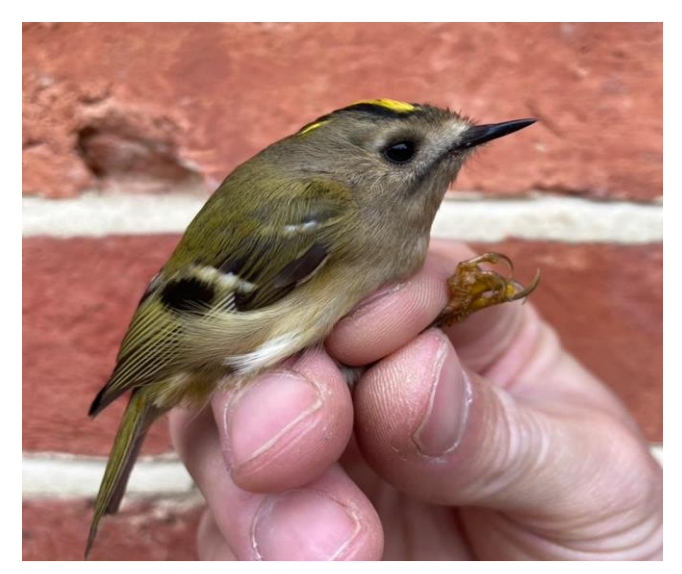
Ringing a Goldcrest during biological surveys.

In terms of staff there were presentations on a range of biodiversity related topics, including one on winter in wildlife, and explaining local sites that have biodiversity value. There is an ongoing dialogue with officers in the Planning Department and Parks and Countryside. These are two important Departments for delivering the aims and objectives of Wilder Horsham District. There was a