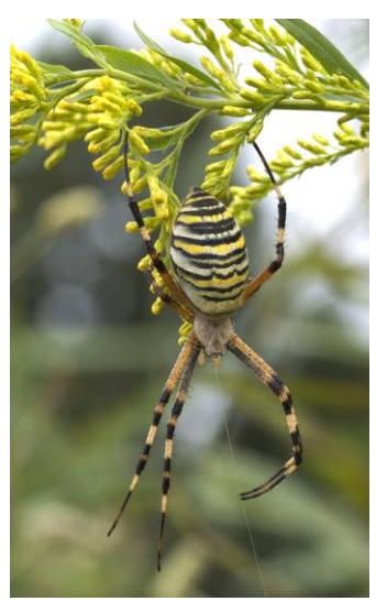
The rare Wasp Spider.