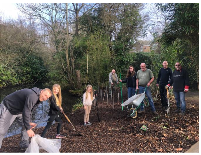
The Lakeside Conservation Volunteers hard at work improving Ayshe Court Lakes for wildlife, with the whole community chipping in.