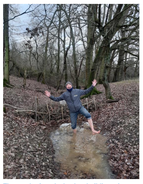
The result of our leaky dam building – it worked!