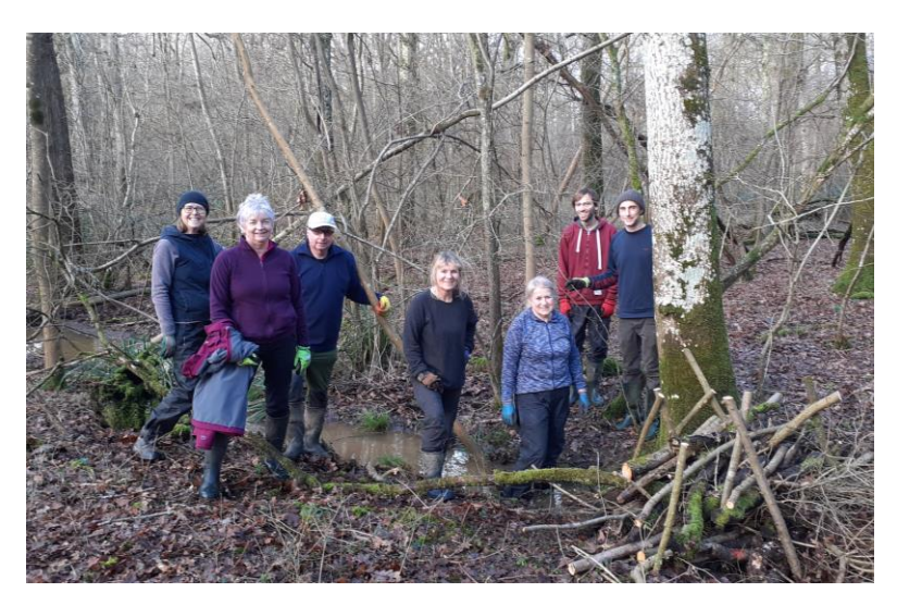
Pretending to be beavers and building leaky dams.