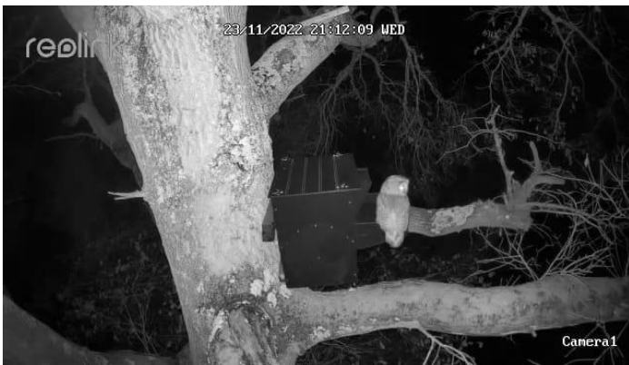
A Tawny Owl captured making one of several new owl nesting boxes funded by the Nature Recovery Award at Raylands Country Park its home.