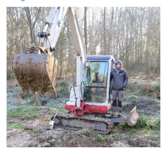
A digger arrives on site at Benlands Nature Reserve to dig a new pond and create a new habitat on the land.