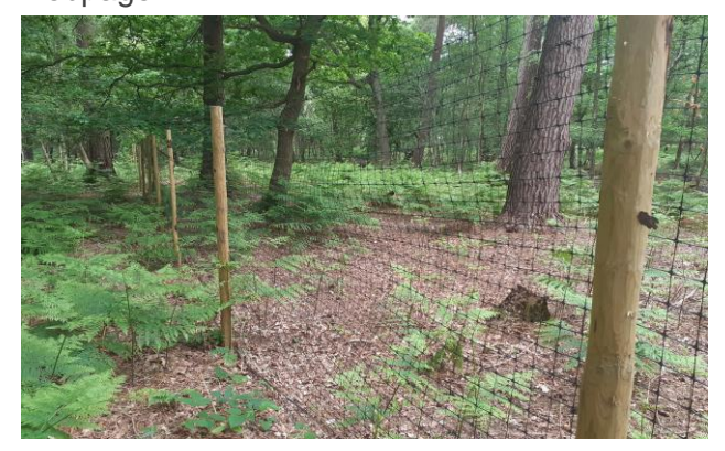
After installing a deer fence at Rackham Cottages to prevent over-grazing (above), the heathland, one of the UK's rarest habitats, is already showing signs of recovery (below).

Projects funded in previous years are also well underway and making exciting progress in aiding nature's recovery. You can learn more about all our past grant recipients and their projects on our webpage.