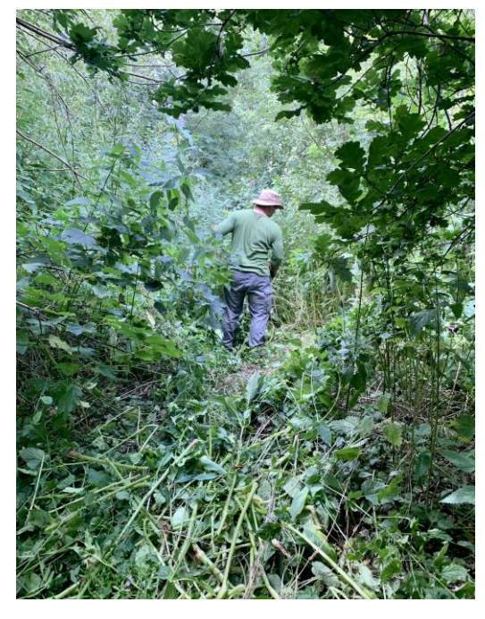
Deep in a 'jungle' of invasive Himalayan Balsam at Warnham Nature Reserve.