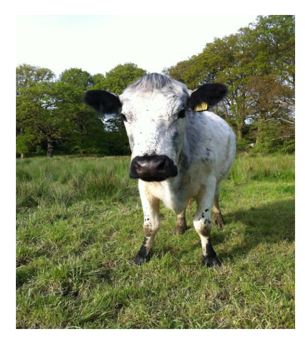
Horsham District Council's cattle are used to graze selected sites to create a more diverse and naturalistic grassland and heath.