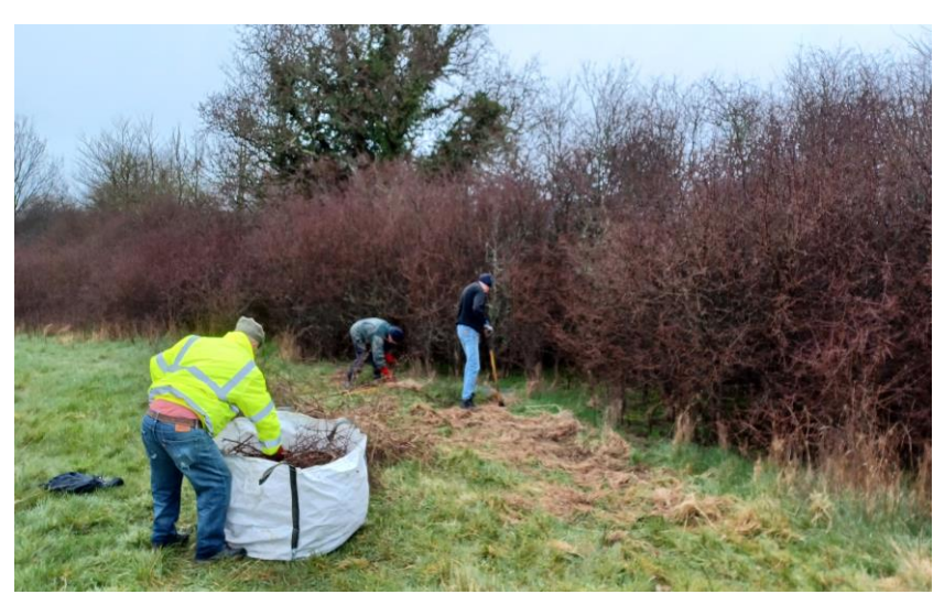
Improving the hedgerows at Woods Mill for Nightingales.