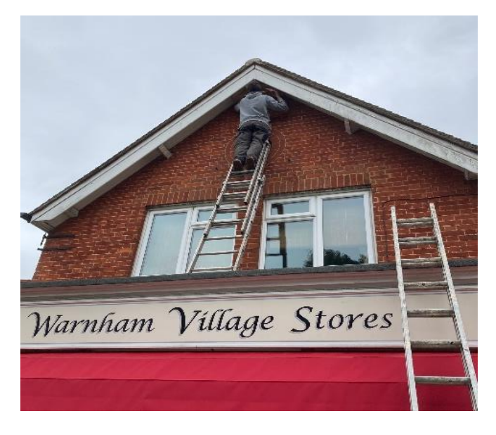
A Swift box being installed in the eaves of Warnham Village Stores, just one of 23 being installed across the village.