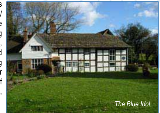
The Blue Idol

3. Following the bridlemay signs until you reach the A272 Coneyhurst/Coolham road, turn right and cycle through Coneyhurst passing the turning to The Blue Idol which, if you have time, is worthy of a detour. It is a rare and superb 17 th century Jacobean Meeting House with unique timber interior panelling and has links to William Penn of Warminghurst, founder of Pennsylvania, USA.