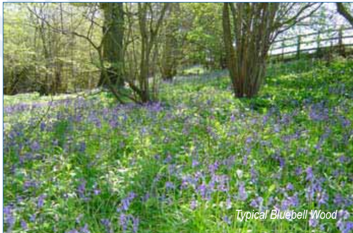
Typical Bluebell Wood

6. At junction of bridlemay and footpath turn right and continue past Elmhurst Farm on your right. A short way past the farm is a bridlemay/footpath crossroads. Go straight over through Shiprods Farm and turn right at the country lane. Continue for 700 metres until you see a bridlemay on your left. Take it and follow the bridlemay straight on until you reach a lane and continue into Barns Green. (The views are lovely and you can see Chanctonbury Ring on your right in the distance). Watch out for the speed bumps.