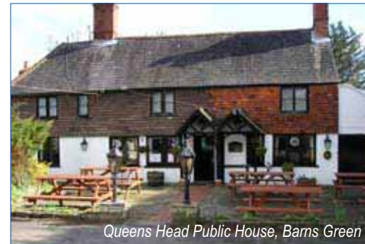
Queens Head Public House, Barns Green

The route passes through gently undulating hills, wooded areas and farmland. The views of the South Downs are particularly good in places. The route rarely leaves bluebell woods which are superb in the spring. Trail conditions will be very muddy after rain.