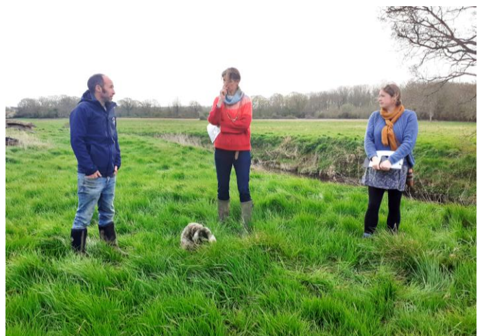
Wilder Horsham District on a joint site visit in Shermanbury with the Ouse and Adur Rivers trust (OART).

Achieving practical, on-the-ground change for nature’s recovery is only possible with the support of the landowners and community groups we work with, and our wonderful volunteers. We would like to extend a big thank you to all who have been involved in Wilder Horsham District so far as we roll into our fourth year – it is your support that is making this project such a success, and we are very excited to see what we will achieve together in the coming year.