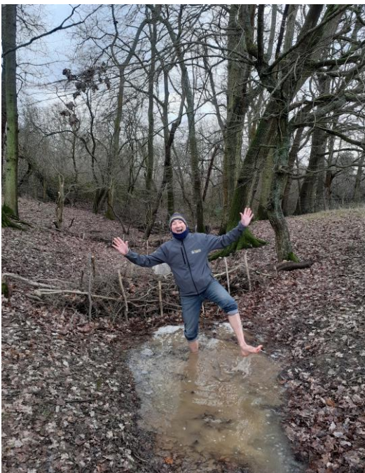
The result of our leaky dam building – it worked!