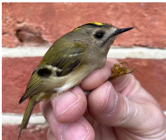
Ringing a Goldcrest during biological surveys.

In terms of staff there were presentations on a range of biodiversity related topics, including one on winter in wildlife, and explaining local sites that have biodiversity value. There is an ongoing dialogue with officers in the Planning Department and Parks and Countryside. These are two important Departments for delivering the aims and objectives of Wilder Horsham District. There was a