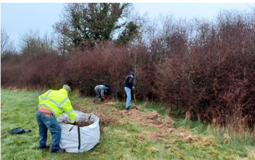
Improving the hedgerows at Woods Mill for Nightingales.