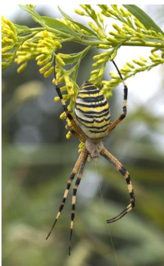
The rare Wasp Spider.