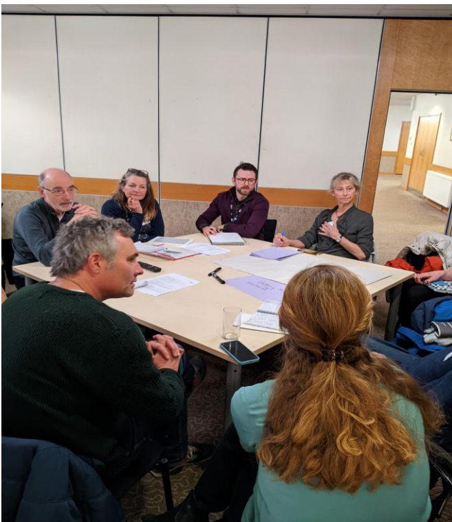
A breakout group at the Parish Council workshops discussing community engagement project ideas.

Another highlight has been engaging with the Storrington and Arun Valley Sussex Wildlife Trust Regional Group, which has led to many successes including funding their exciting project to install swift boxes across Storrington and Sullington, Pulborough, Amberley and Billingshurst through the Nature Recovery Award, and developing a plan of action (with several other actors too) to map and tackle key 'headwaters' of the invasive Himalayan Balsam across the District.