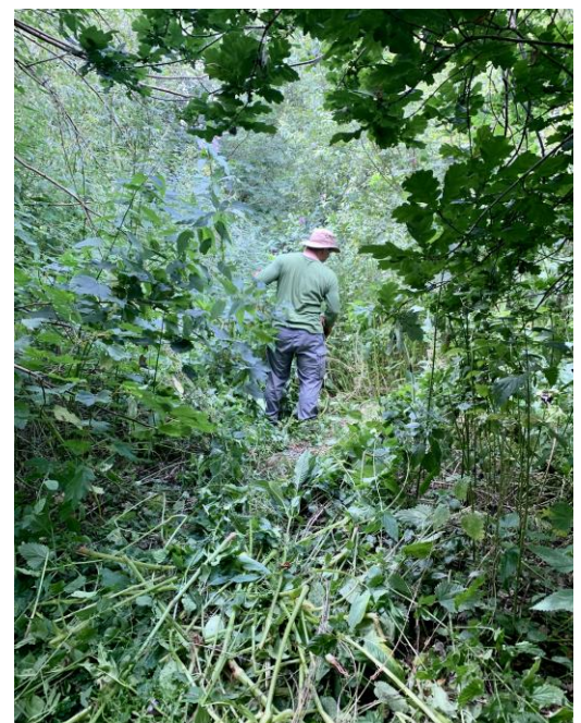
Deep in a 'jungle' of invasive Himalayan Balsam at Warnham Nature Reserve.