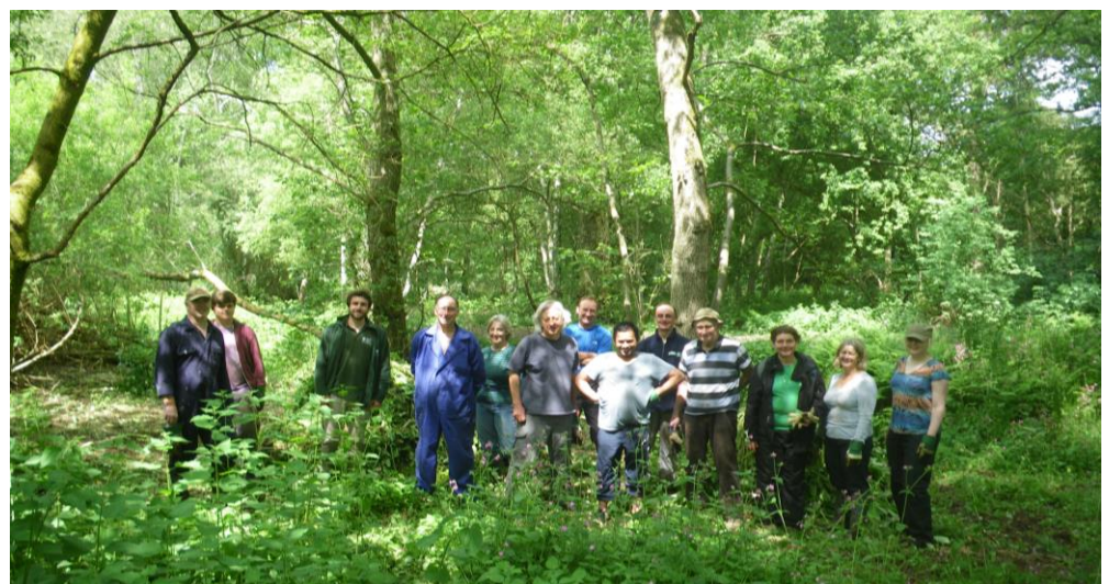
Horsham District Council volunteers out on site.