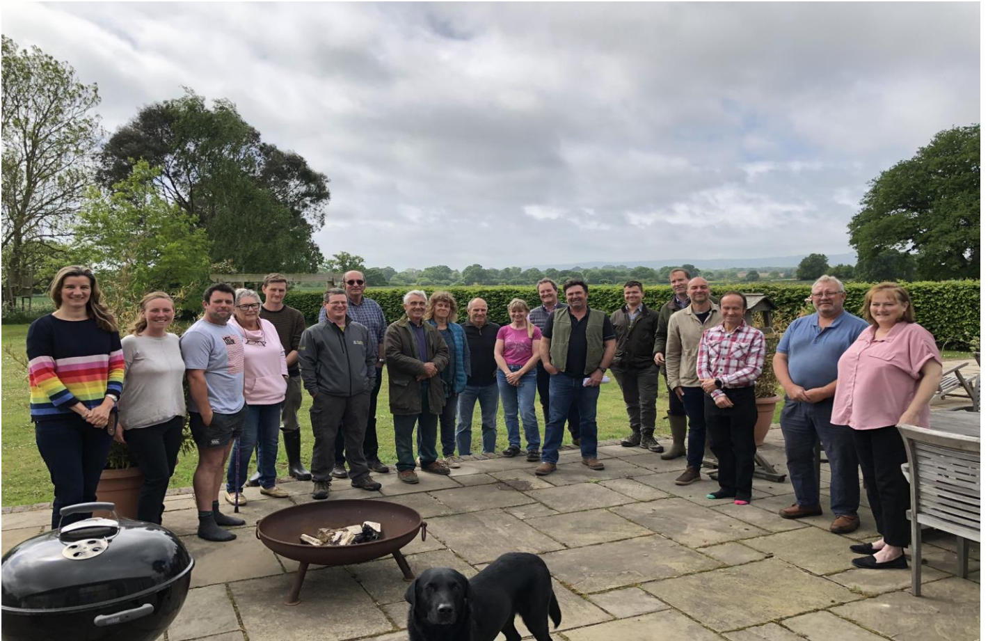
A handful of the landowners and conservation staff involved in the pioneering Adur River Recovery project.