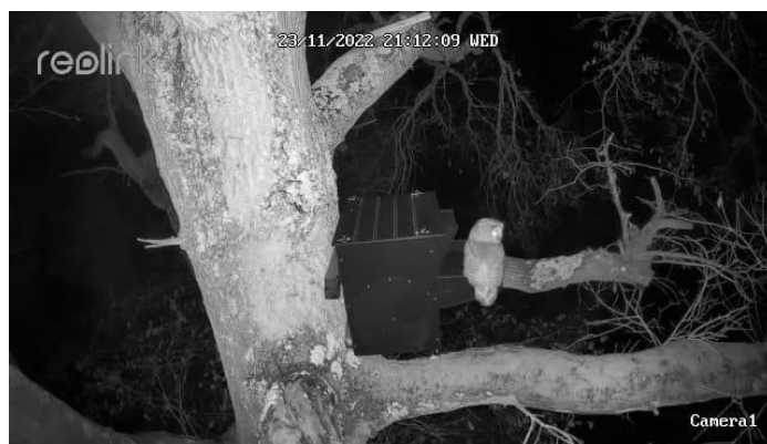
A Tawny Owl captured making one of several new owl nesting boxes funded by the Nature Recovery Award at Raylands Country Park its home.