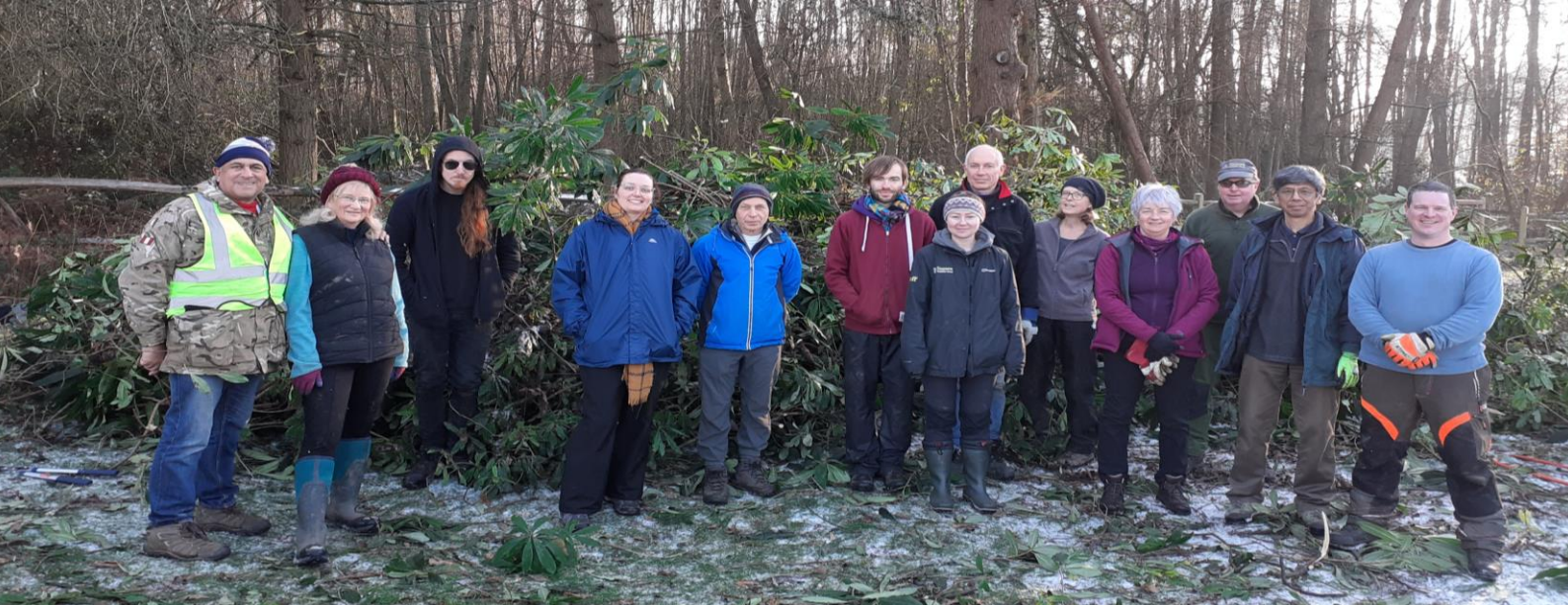
Out on a winter work party in the snow tackling the invasive Rhododendron to help restore an area of woodland, with a small proportion of the removed invasive in a pile behind the volunteers ready to be burned.