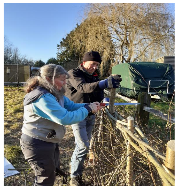
Volunteers learning how to lay a hedge.