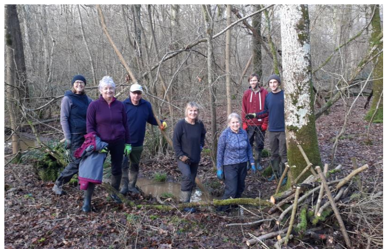
Pretending to be beavers and building leaky dams.