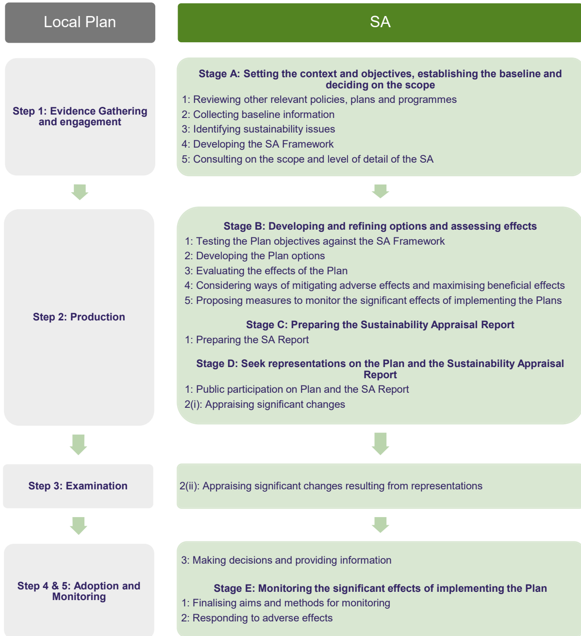
Figure 1.1 Corresponding stages in plan-making and SA