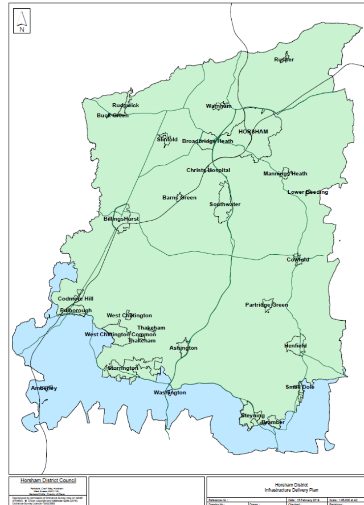
Figure 1: Map of Horsham District containing the administrative area for the IDP

The IDP sets out the infrastructure likely to be required for development across Horsham District, although it does not include areas of the South Downs National Park, located to the south of the District. The National Park Authority is a local planning authority in its own right and has produced an IDP to support the South Downs Local Plan which was