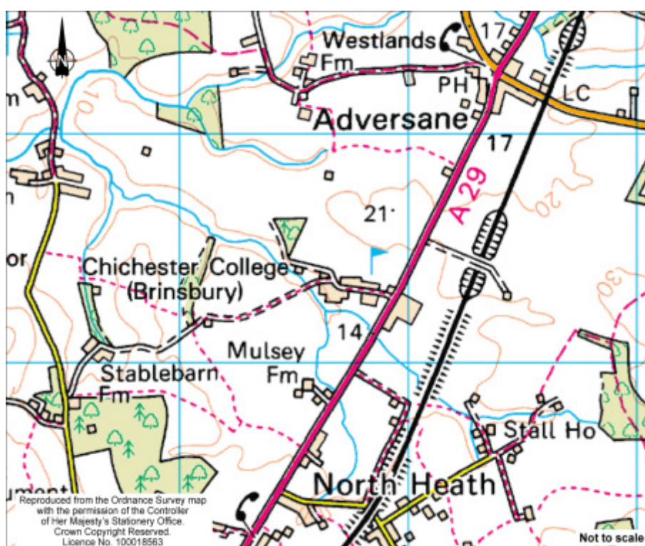
Map 1: Location of Brinsbury Campus

1.10 Brinsbury Campus is set in an estate of 250 hectares that straddles the A29 (Stane Street), between Billingshurst and Pulborough (see Map 1 below). Both towns have a train station which provides north/south rail access and both relate well to the surrounding road network, particularly in east/west directions.