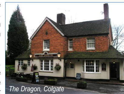
The Dragon, Colgate

1. Start at The Downs Link car park opposite The Bridge House Inn at Copsale (GR171249). Turn right from the car park. Ignore left turn (Broadwater Lane) and continue to bridleway on left on the corner by driveway to Elliots Farm.