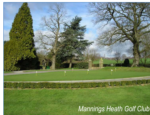
Mannings Heath Golf Club

3. Left and left again on the A281 towards Mannings Heath (you can push your bike on the footpath of this busy road). Take next turn on the right (Church Road) and follow it into Goldings Lane and continue to T-junction.