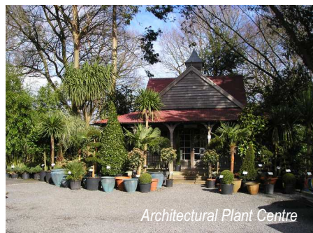
Architectural Plant Centre

Then head for clump of trees at top of hill in field and follow bridleway signs along the ridge to minor road at Newstead Farm. Continue on farm road and turn right at bridleway sign where road descends steeply. Follow bridleway down steep descent over a ford, across a field and a steep ascent to road.